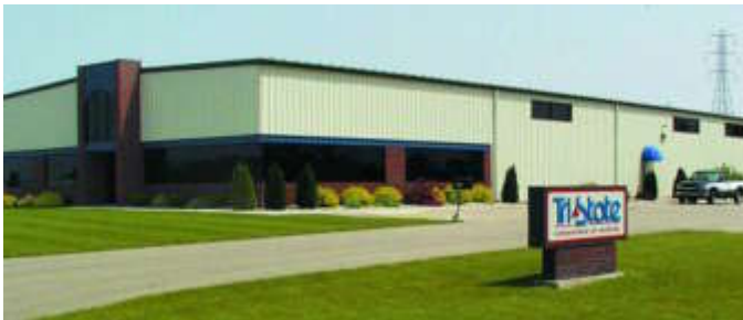
▲ Tri-State Compressed Air Systems