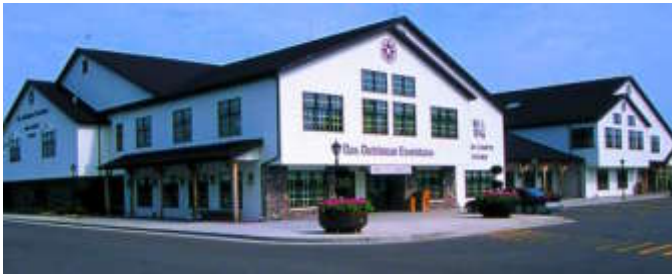
▲ Das Dutchman Essenhaus Restaurant & Inn