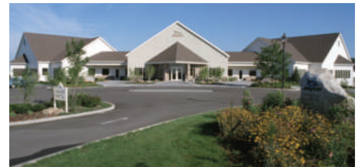
▲ Jayco Corporate Offices

With the traditional plan & spec process, no construction takes place until the design and bidding process is complete, so you lose precious time. The DesignBuild process allows construction to start while plans are still being finalized, so you can move into your building sooner.