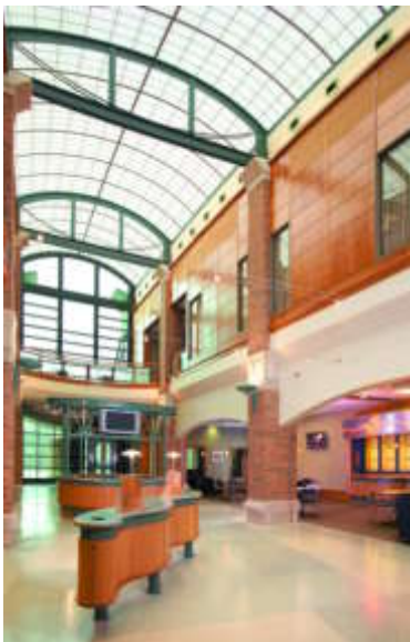
◀ Farm Bureau Credit Union

At DJ we apply extra effort to every renovation and new construction project we undertake.