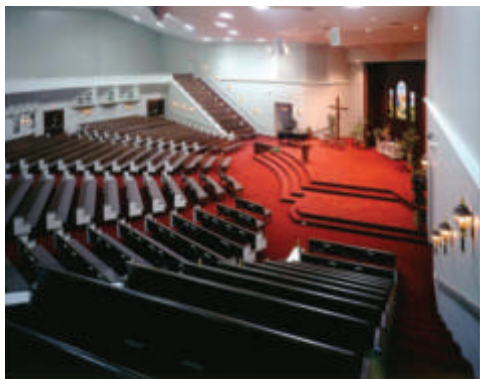
▲ Clinton Frame Mennonite Church

At DJ Construction, we work with all construction approaches. If you're leaning toward the traditional plan & spec approach, we can still apply the talents of our team to ensure efficiency, time and cost saving benefits to your project. However, we have found DesignBuild to be far superior to any other method.